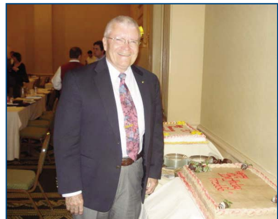
Keynote speaker, Apollo 13 Astronaut Fred Hais